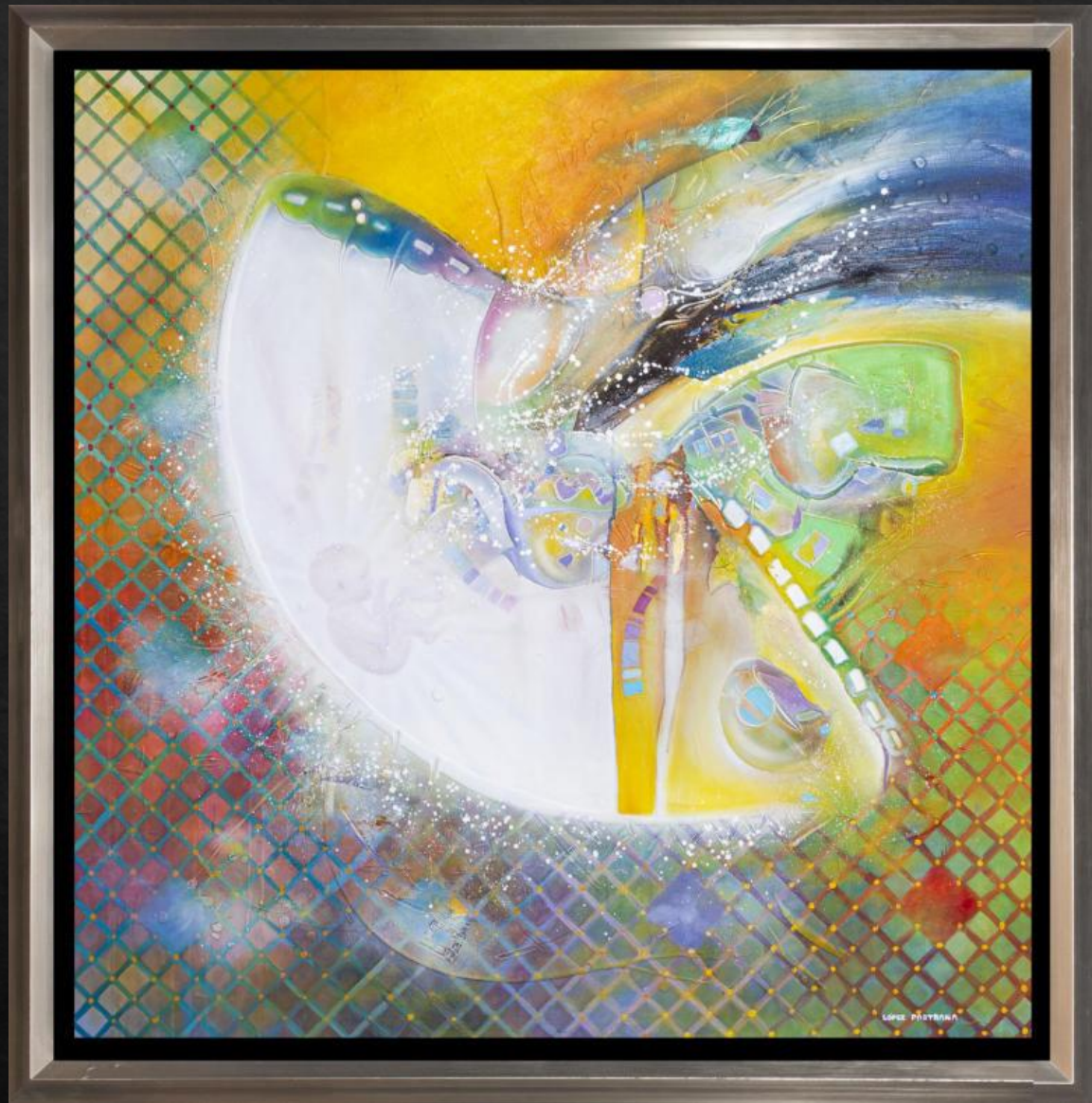
“LOS SUEÑOS DE UN FETO” (The Dreams Of a Fetus) 120x120cm/ 47x47in