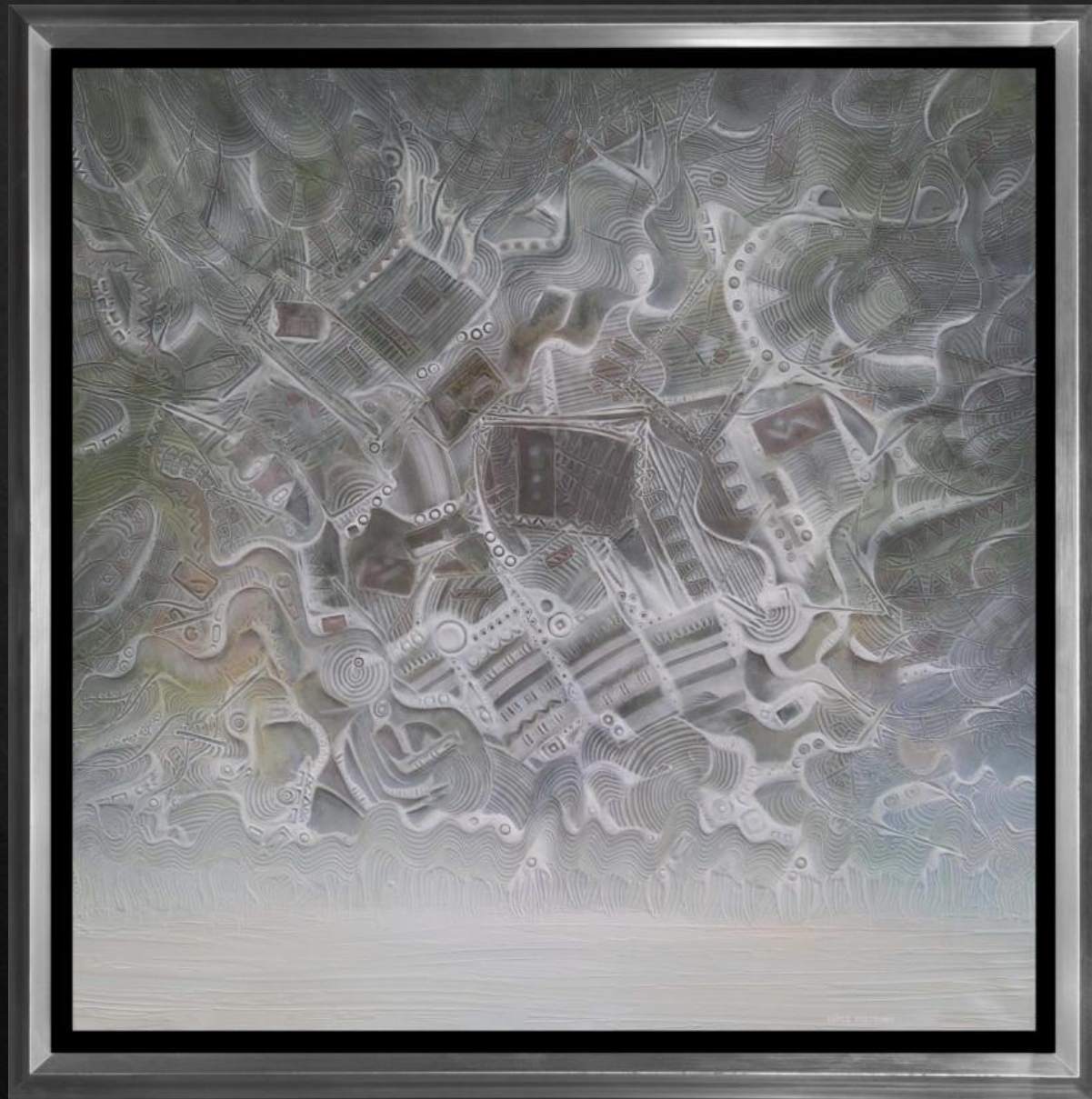
“CONSTRUCCIÓN GÉLIDA” (Gelid Construction) x120cm/ 47x47in