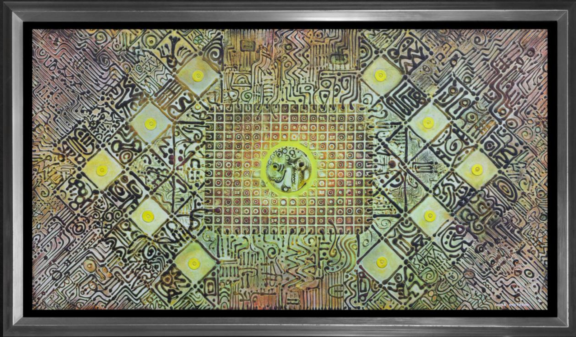
“MICROCHIP ORGÁNICO” (Organic Microchip) 60x110cm/ 23x43in