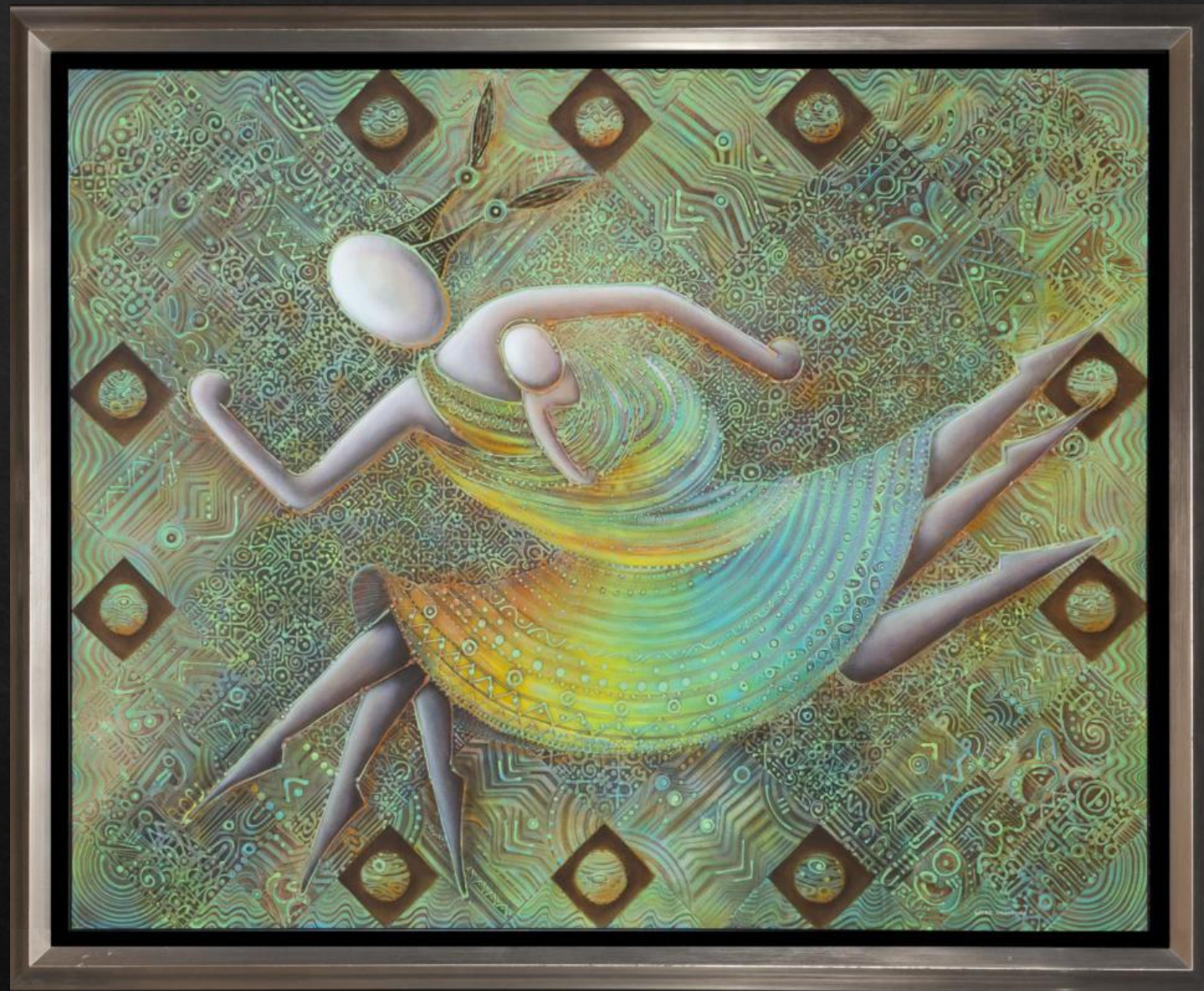
“CRUZANDO LA FRONTERA” (Crossing The Frontier) 120x150cm/ 47x59in