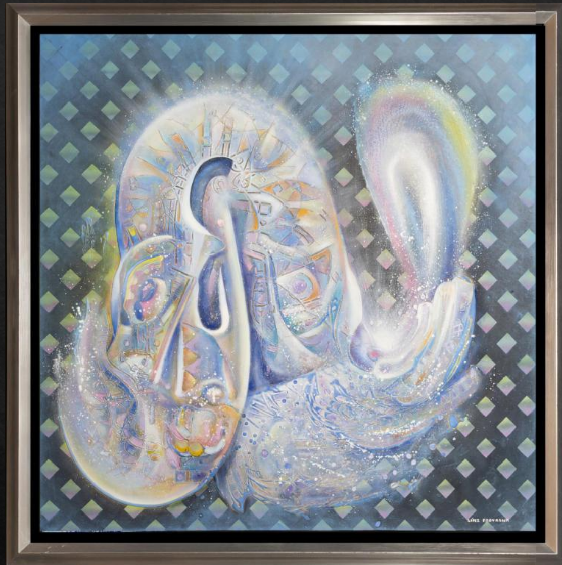
“CONSCIENCIA ORGÁNICA” (Organic Consciousness) 120x120cm/ 47x47in