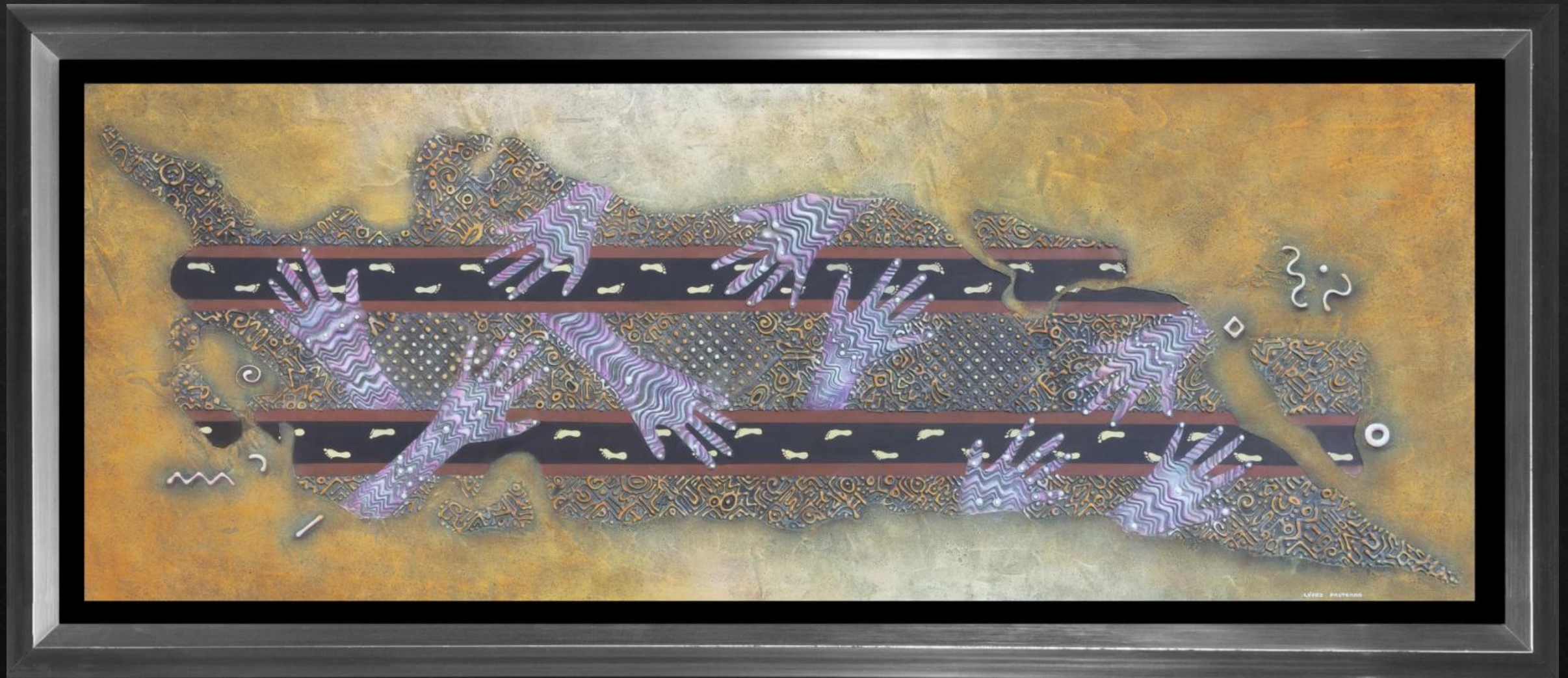
“DAR Y QUITAR” (GIVE AND TAKE) 80x215cm/ 31x84in