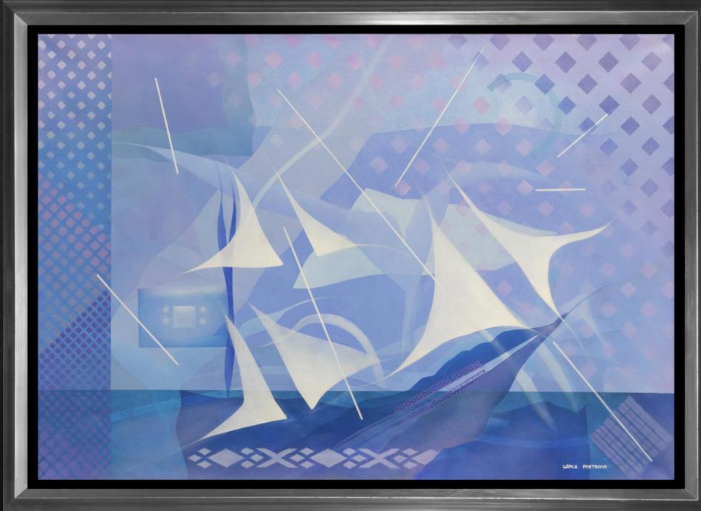
“ACUATICO” (Aquatic) : 2012 70x100cm/ 27x39in