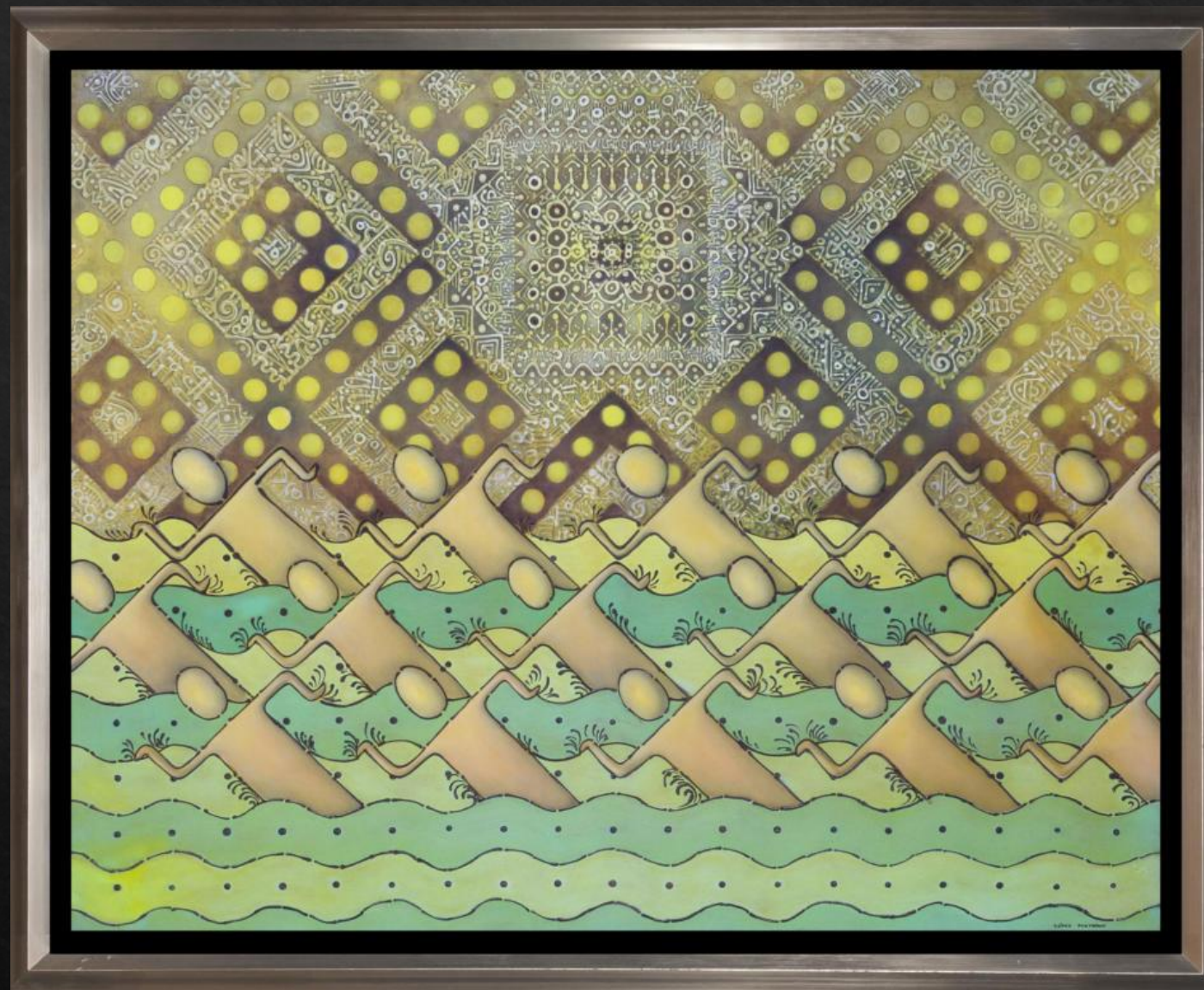
“MOVIMIENTO MIGRATORIO” (Migratory Movement) 150x120cm/ 59x47in