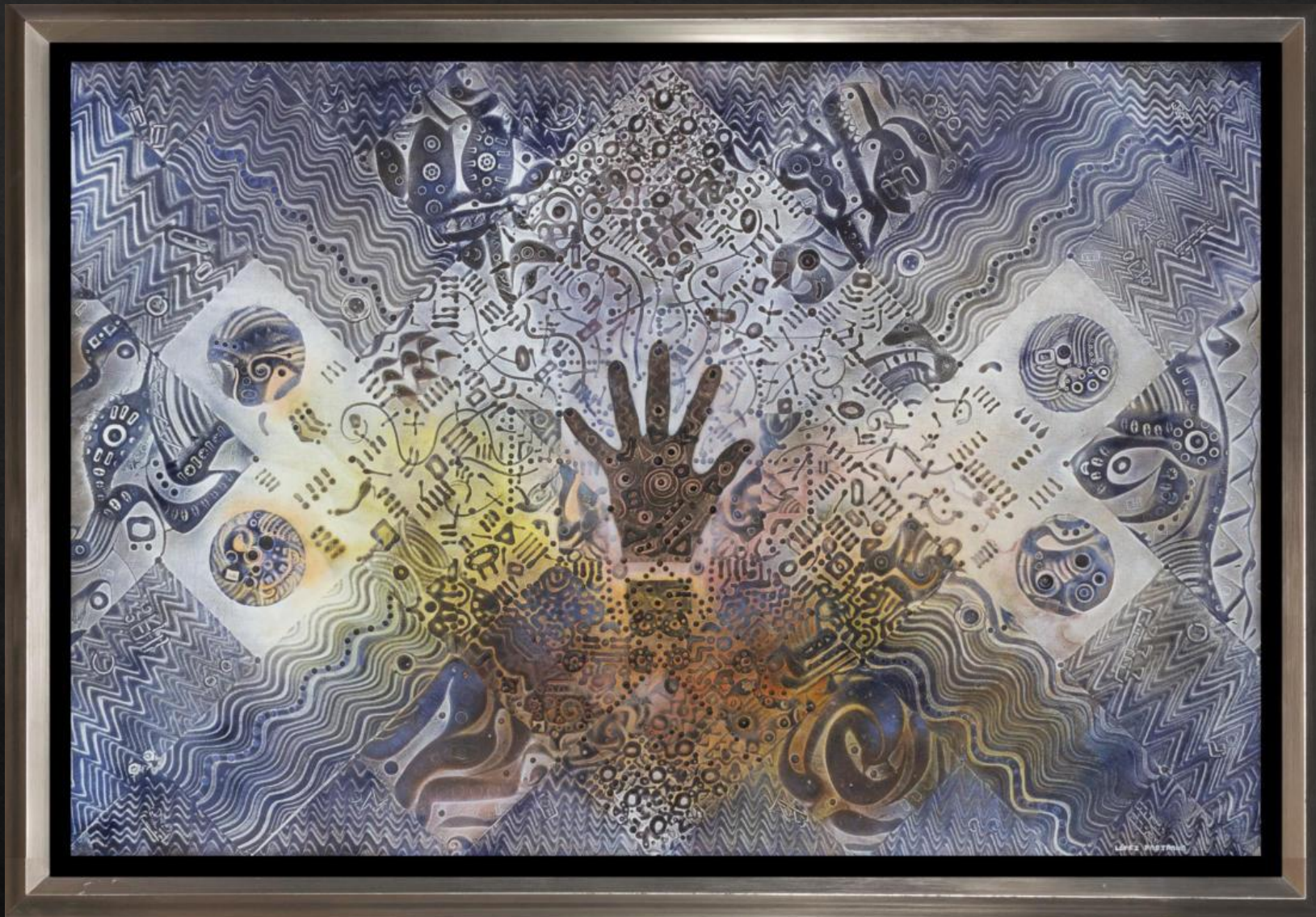
“LA HERRAMIENTA PERFECTA” (The Perfect Tool) 80x120cm/ 31x47in