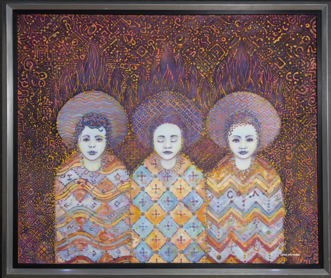
“LOS TRES SANTITOS” (The Three Saints) 100x120cm/ 47x39in