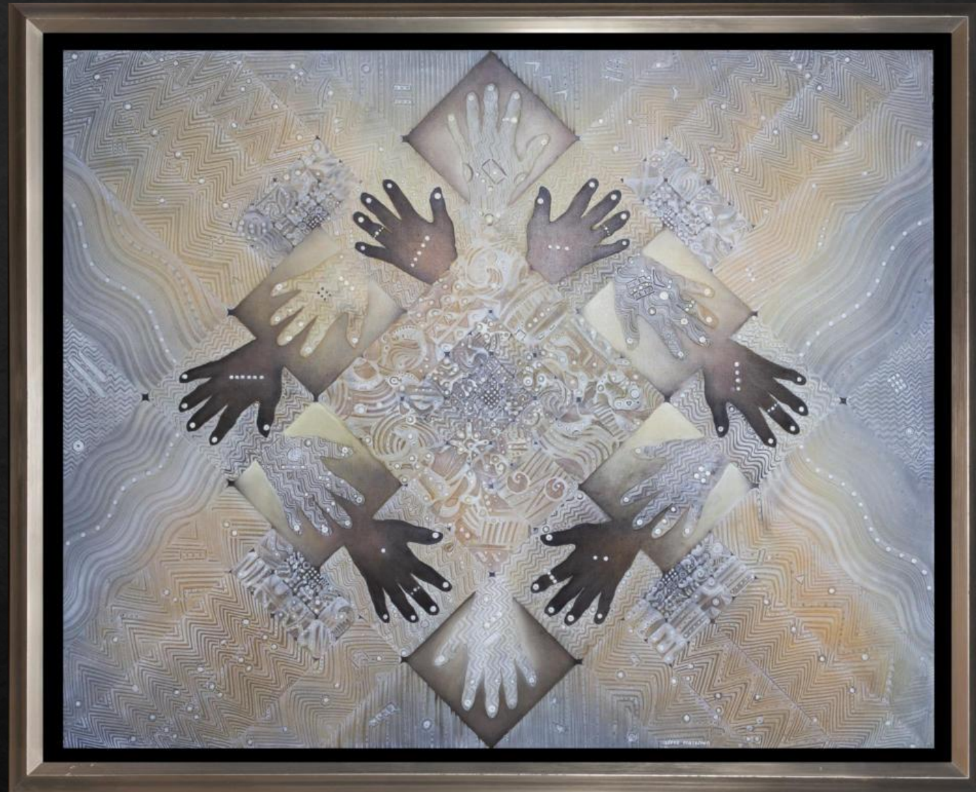
“FRATERNIDAD” (Fraternity) 120x150cm/ 47x59in