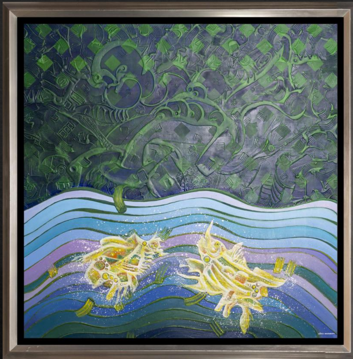
“MICROBIOS” (Microbes) 130x130cm/ 51x51in