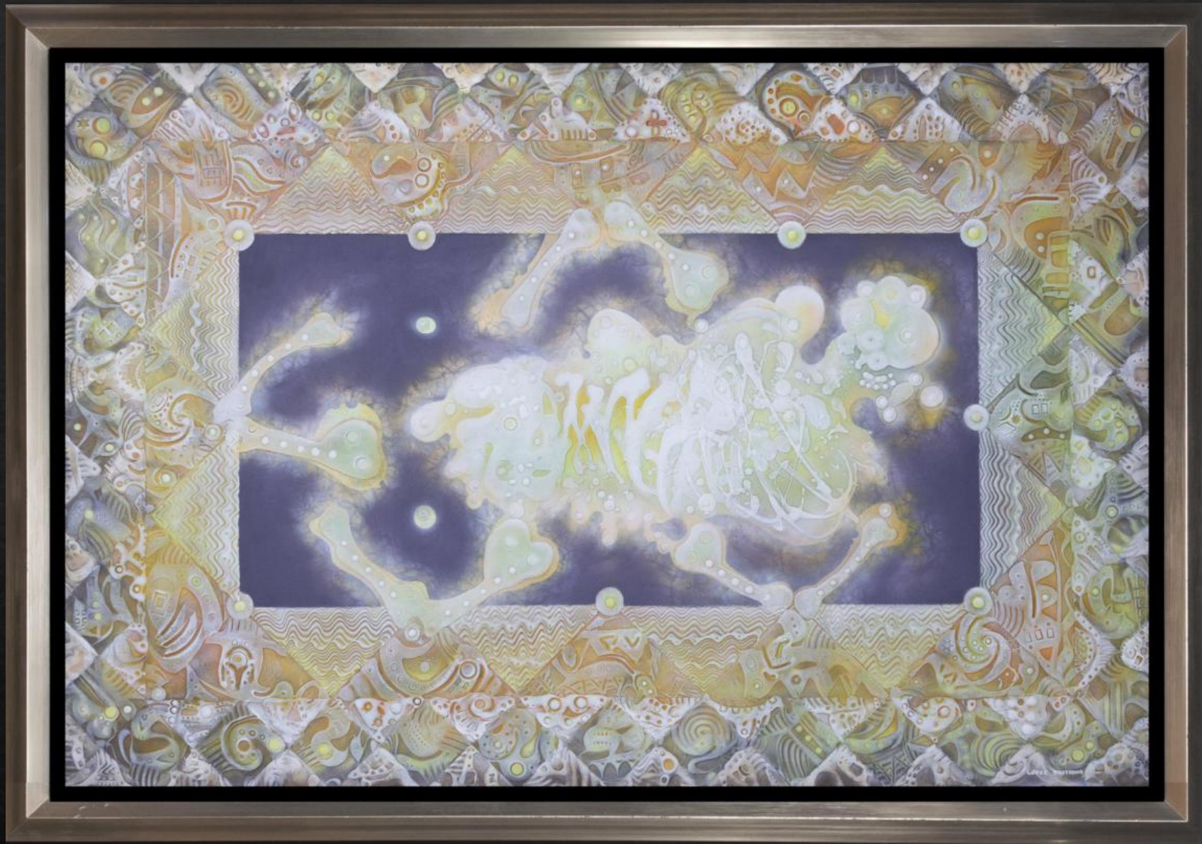
“CHERNOBYL” 100x150cm/ 39x59in