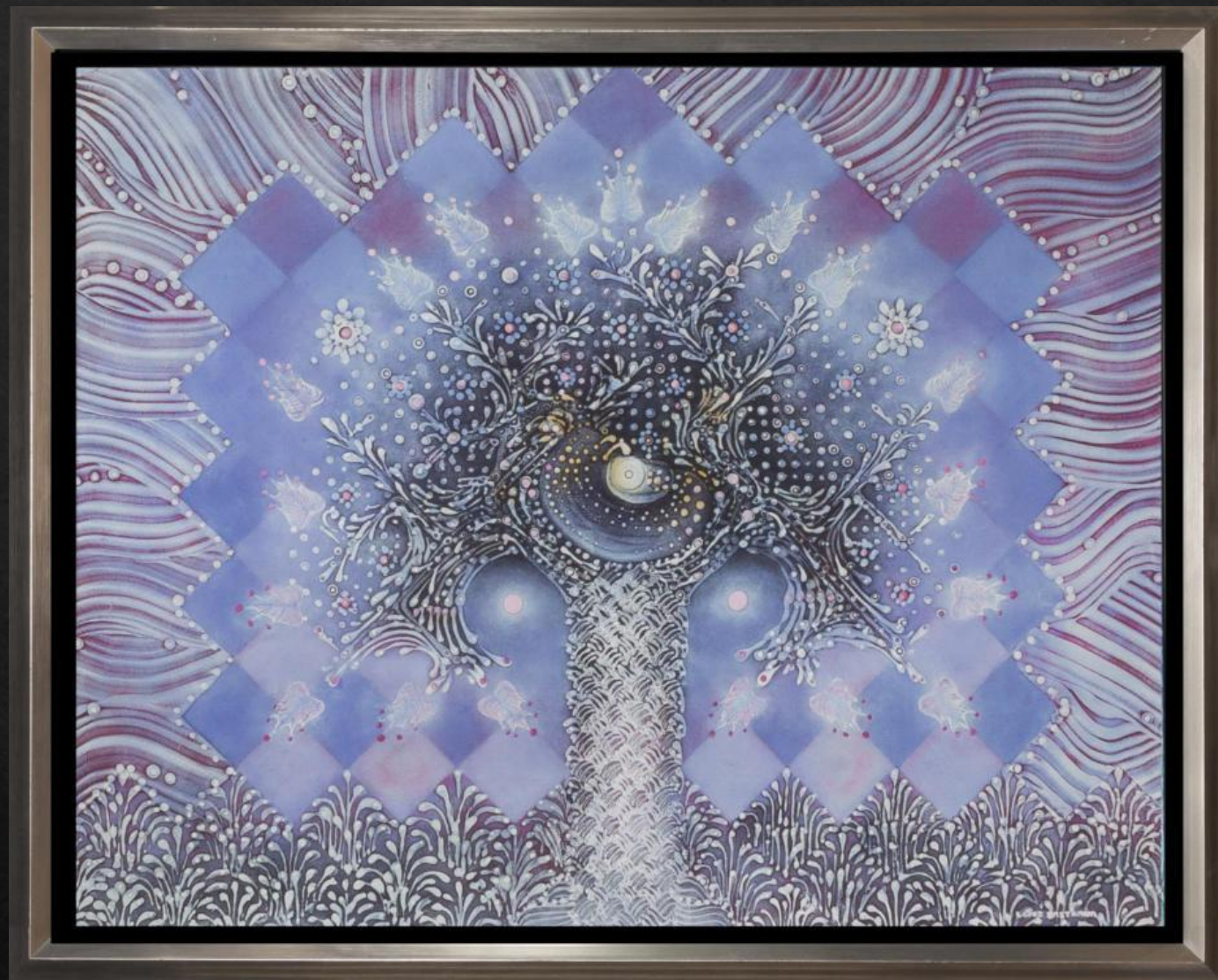
“EL ARBOL ARMONICO” (The Harmonic Tree) 80x100cm/ 31x39in