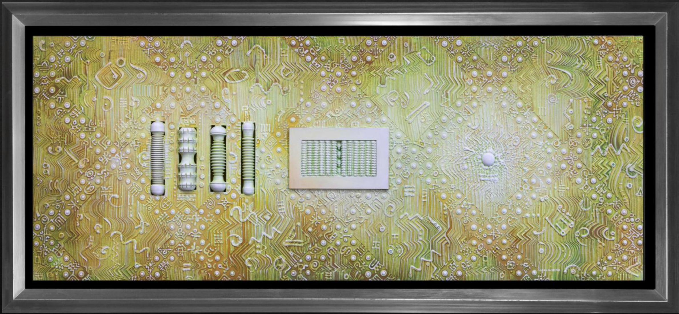
“LOS CUATRO CRÁNEOS” (THE FOUR SKULLS) 80x200cm/ 31x78in