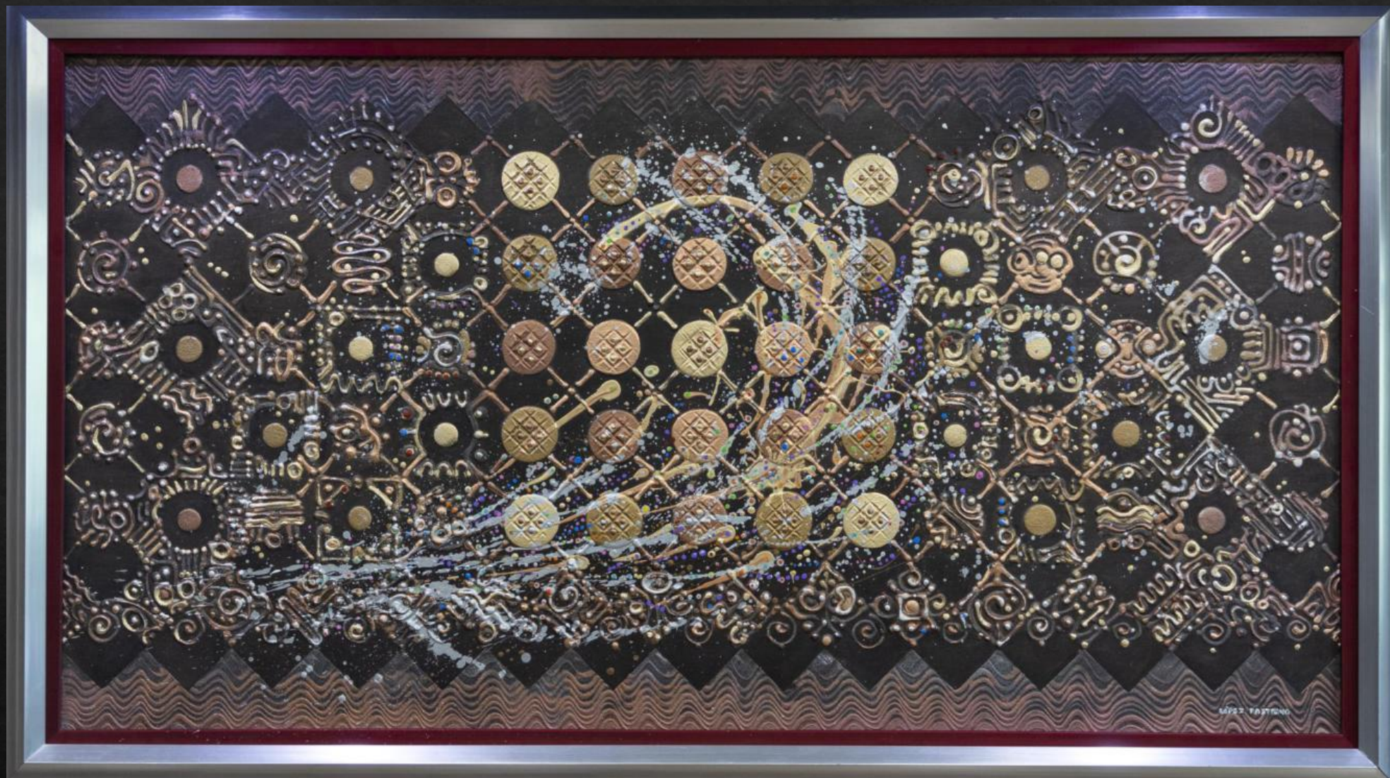
“MOVIMIENTO CUÁNTICO” (Quantum Movement) 80x150cm/ 31x59in