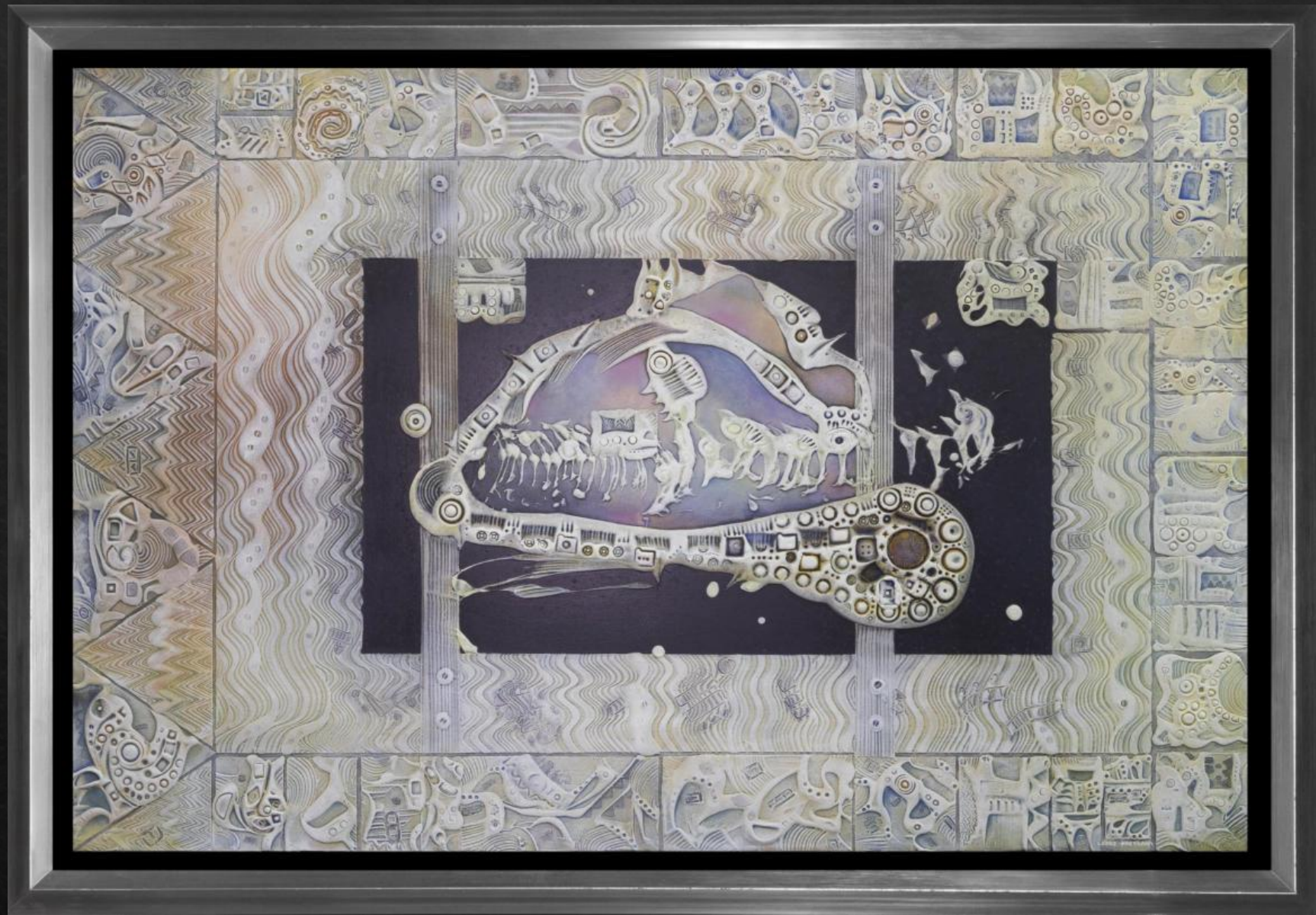
“TOXINA TRANSGÉNICA” (Transgenic Toxin) 100x150cm/ 39x59in