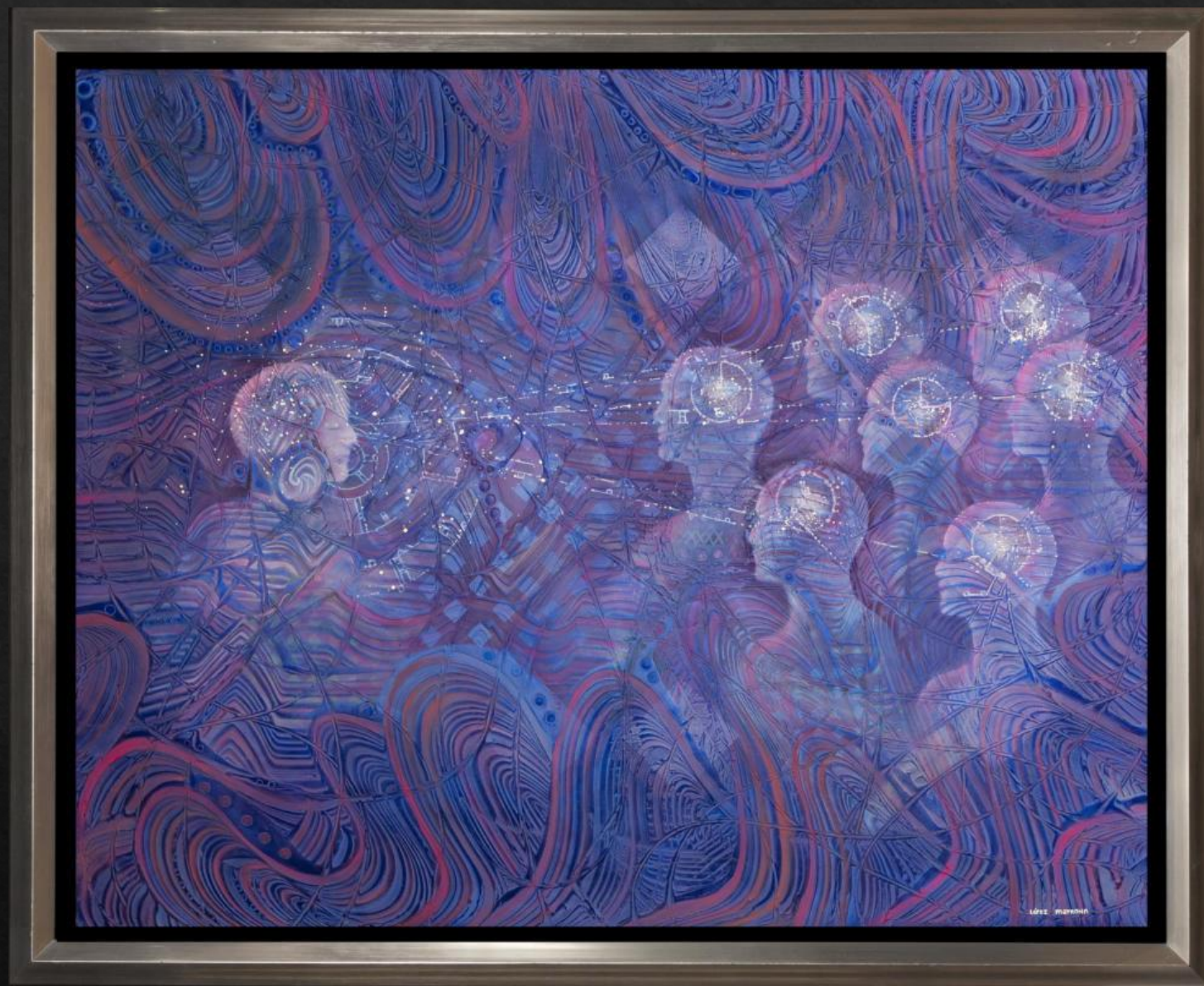
“EL LÍDER” (The Leader) 120x150cm/ 47x59in