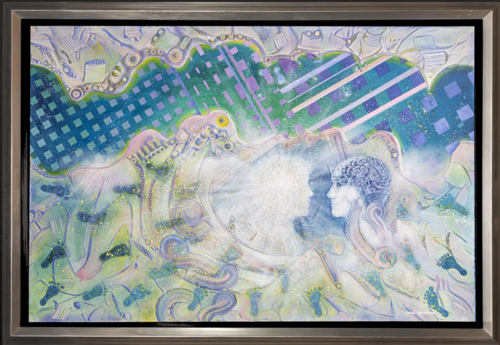
“DUALIDAD” (Duality) 80x120cm/ 31x47in