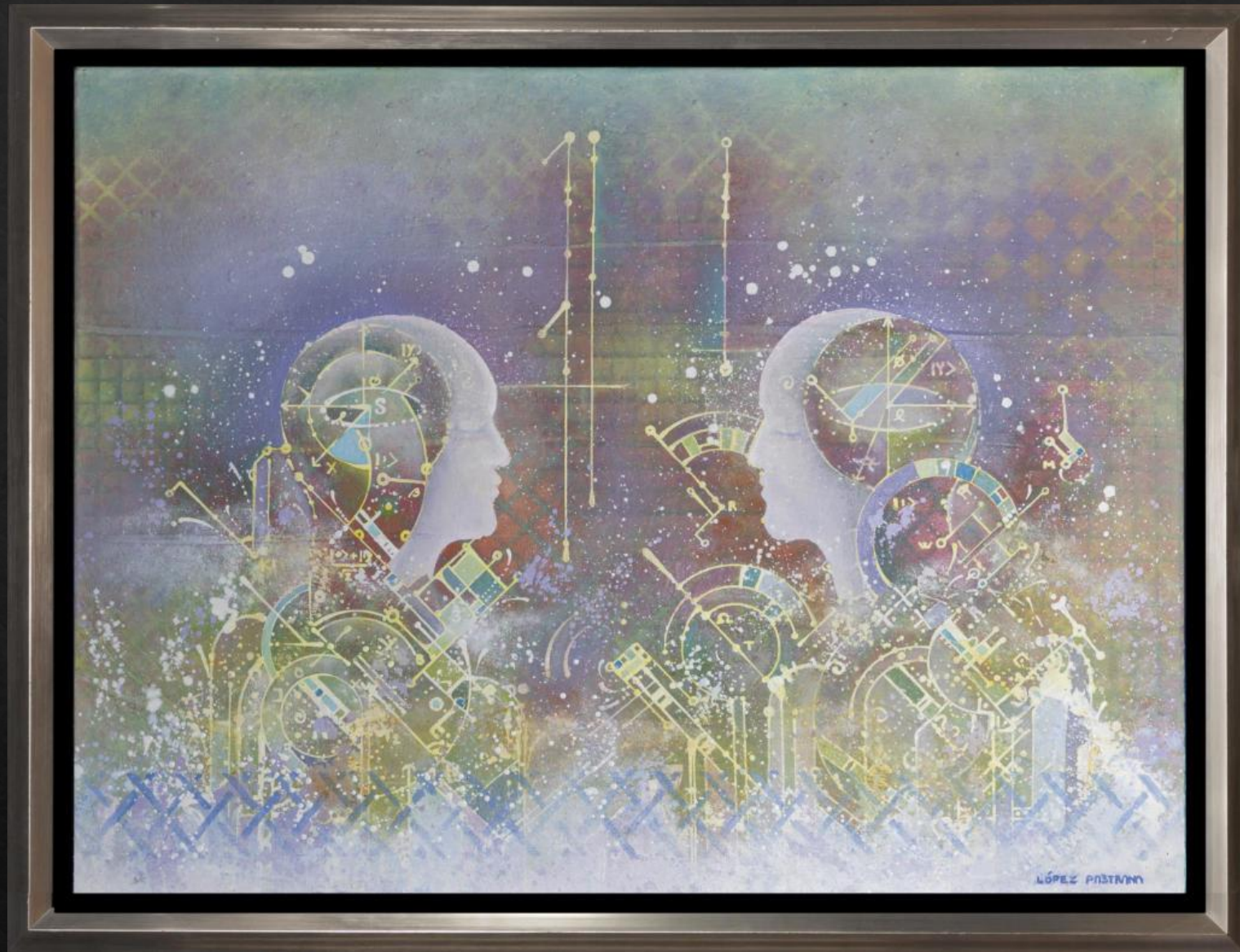
“COMUNICACIÓN” (Communication) 60x80cm/ 23x31in