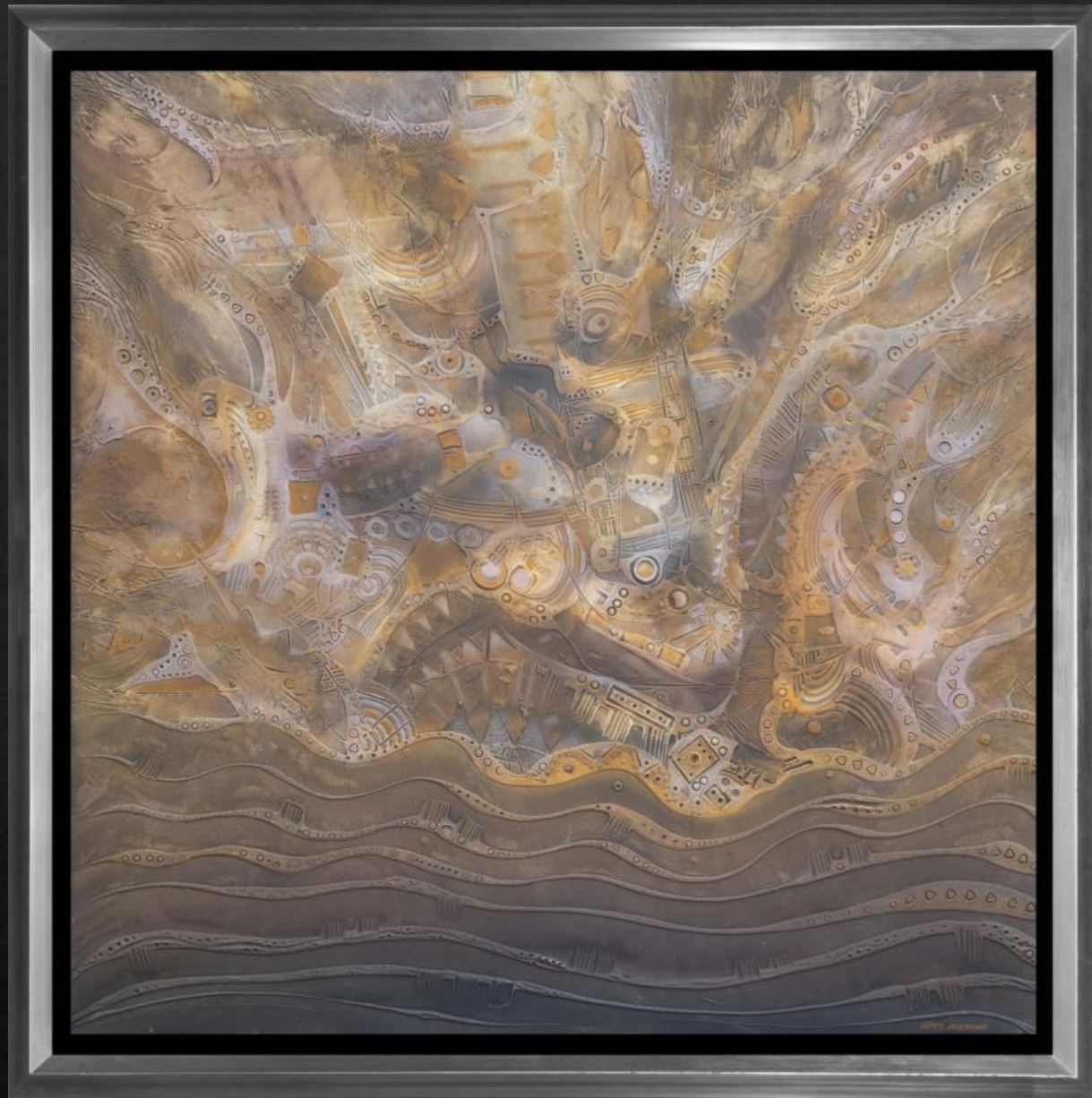
“HOMENAJE CROTÁLICO A NEZAHUALCÓYOTL” (Crotallic Tribute to Nezahualcoyotl) 120x120cm/ 47x47in