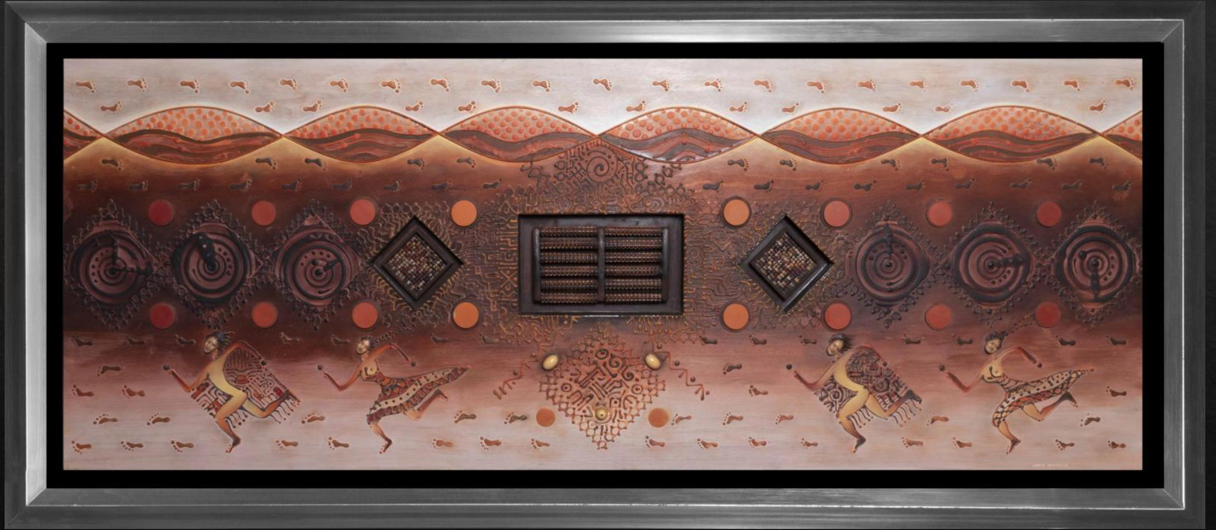
“MIGRACIÓN SELECTIVA” (SELECTIVE MIGRATION) 80x210cm/ 31x82in