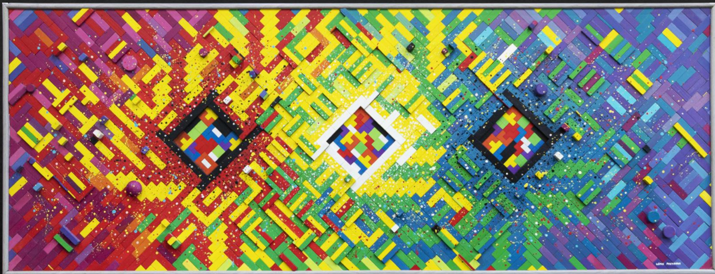
“LA TRIADA” (The Triad) 80x212cm/ 31x83in