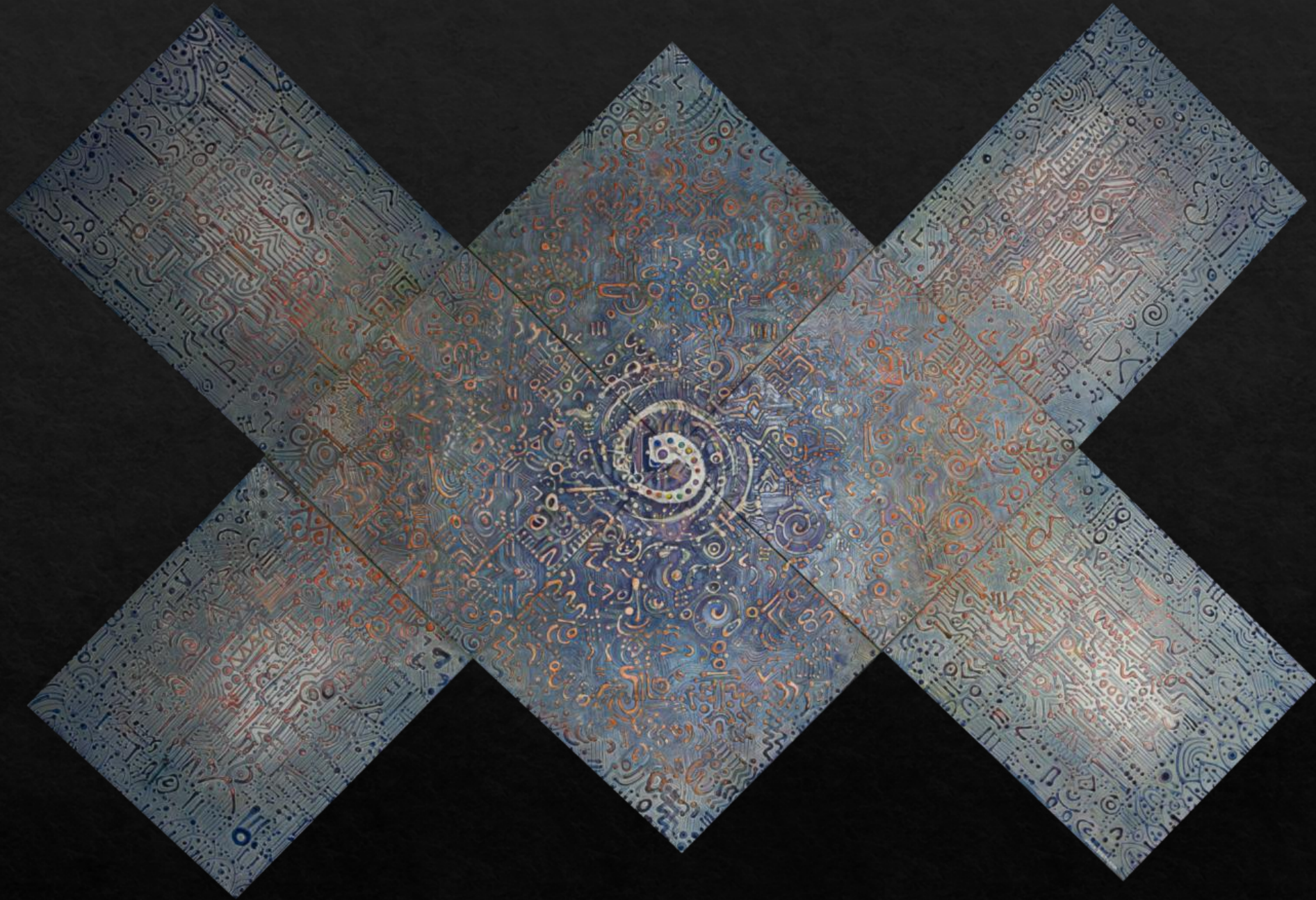
“BIG BANG” 140x230cm/ 55x90in