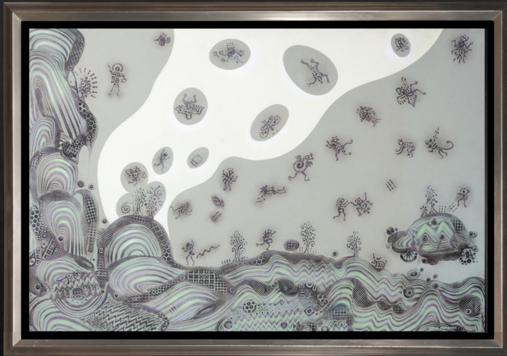
“MIGRACIÓN DE LAS ÁNIMAS” (Migration Of The Spirits) 100x150cm/ 39x59in