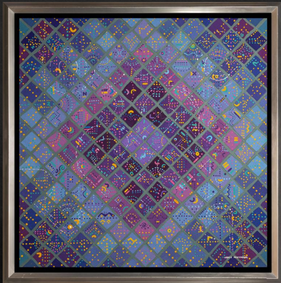
“LOS QUARKS” (The Quarks) 100x100cm/ 39x39in