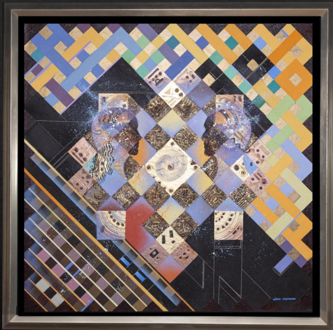
“RELACIÓN” (Relationship) 100x100cm/ 39x39in