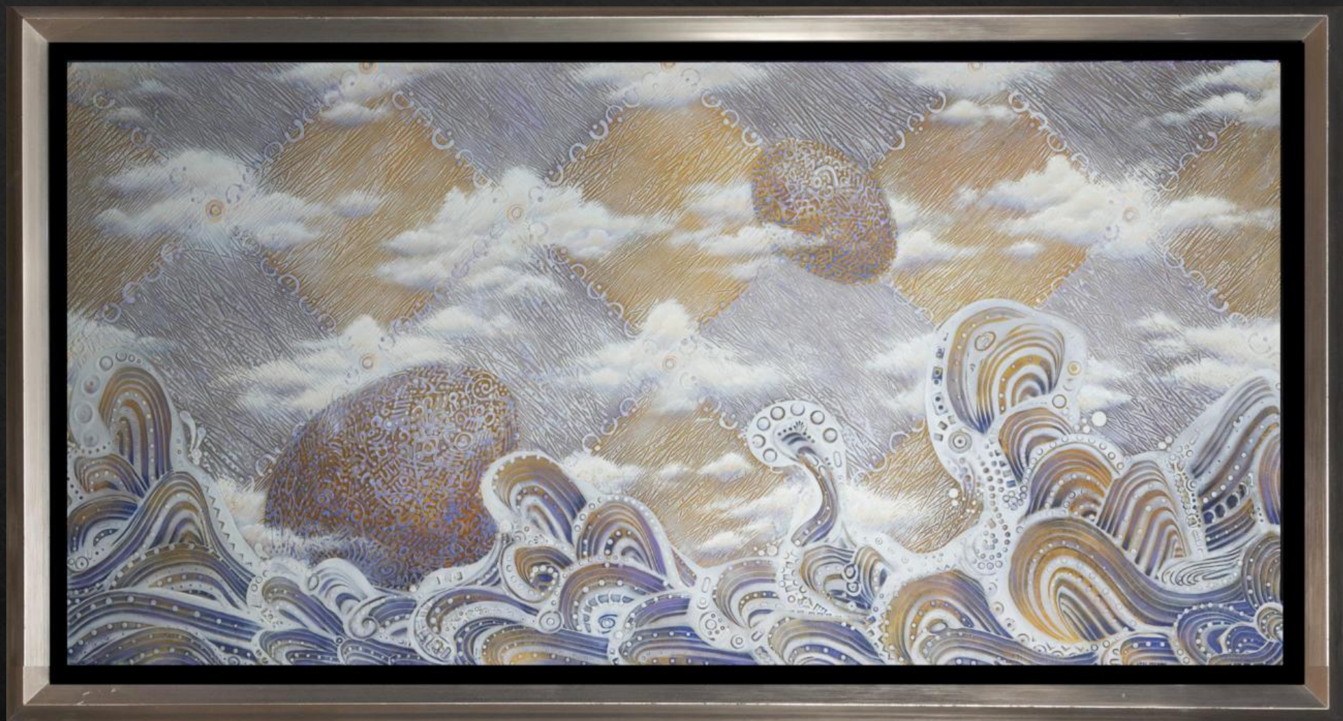
“ENCUENTRO” (Meeting) 100x200cm/ 39x78in