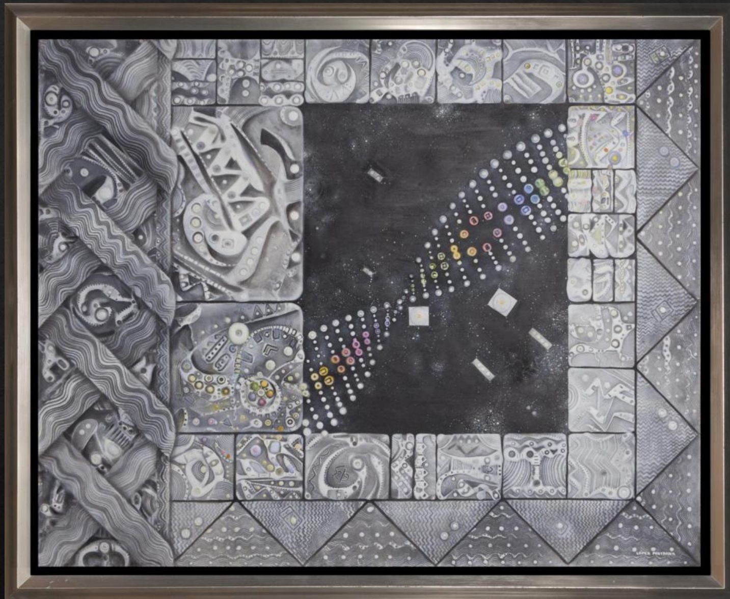
“ADN Y ARN” (DNA & RNA) 120x150cm/ 47x50in