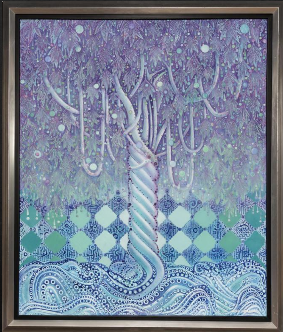
“LA CEYBA SAGRADA” (Sacred Ceyba) 120x100cm/ 47x39in