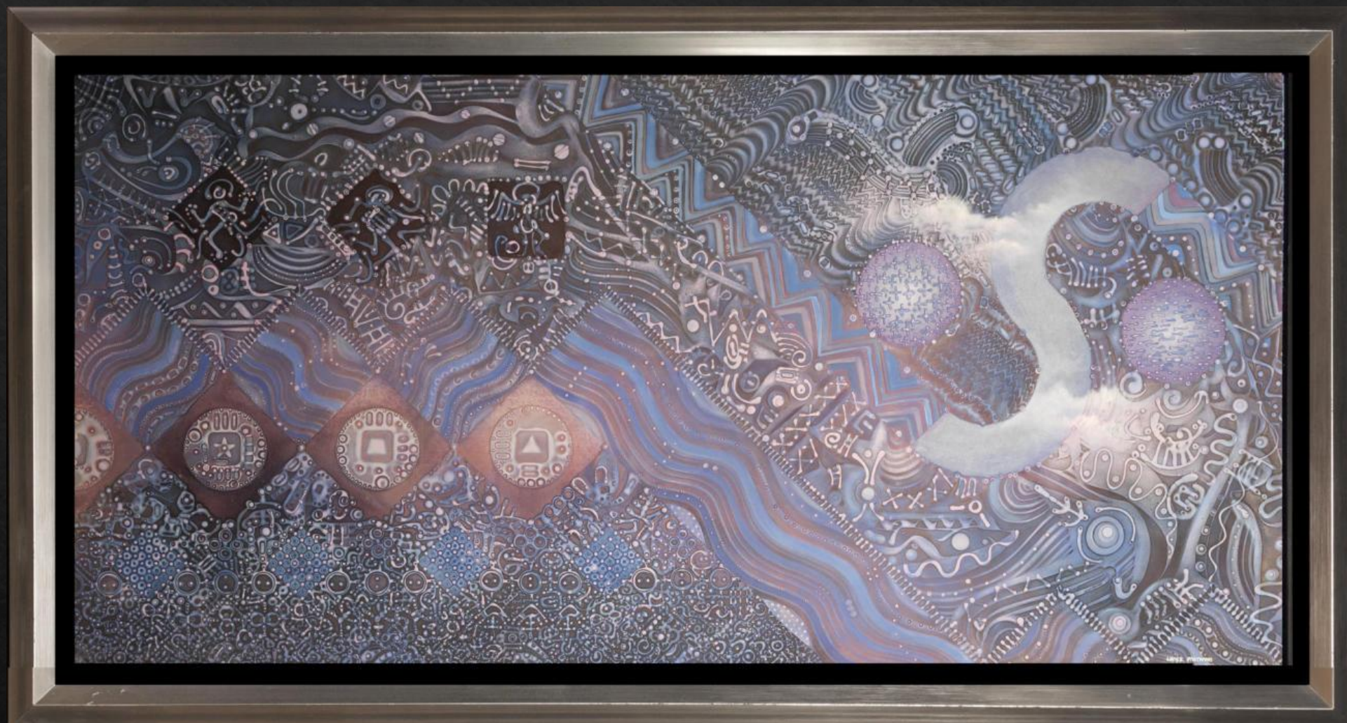
“TRILOGÍA” (Trilogy) 100x200cm/ 39x78in