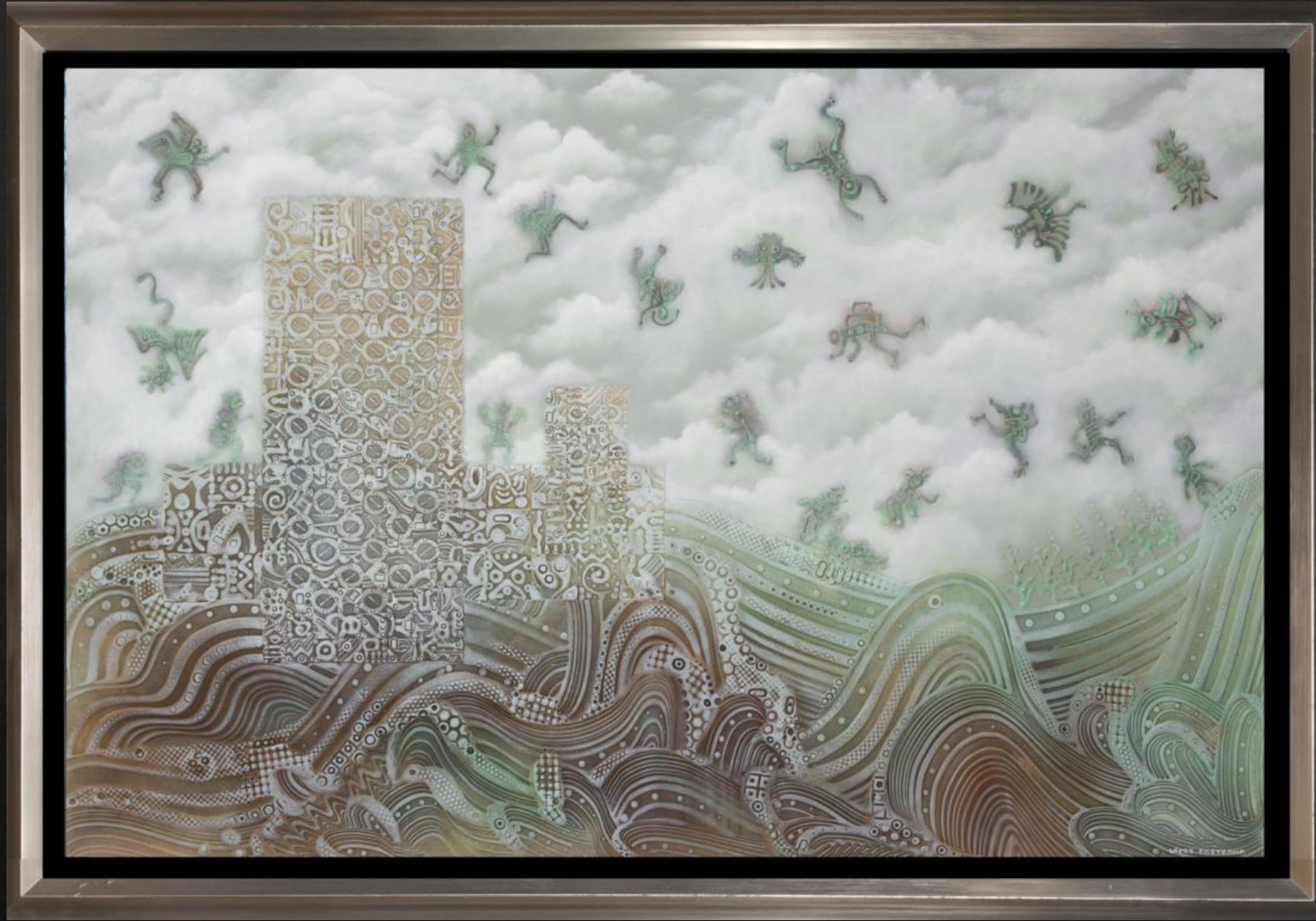
“MIGRACIÓN” (Migration) 100x150cm/ 39x59in