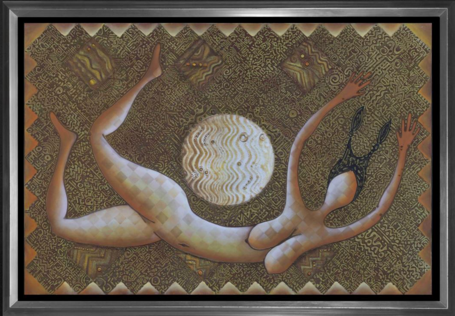
“LA CAÍDA” (THE FALL) 100x150cm/ 39x59in