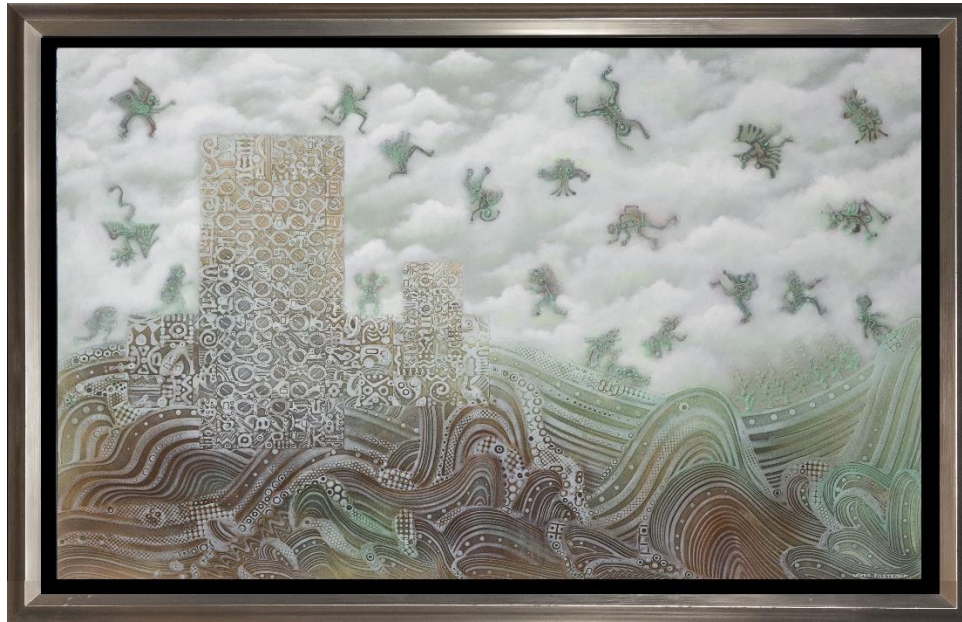
A glimpse into the world of "Migración". The piece uses the movement of shapes across the landscape formed by small men flying on the air. Curves and circles are frequent patterns used in this artwork